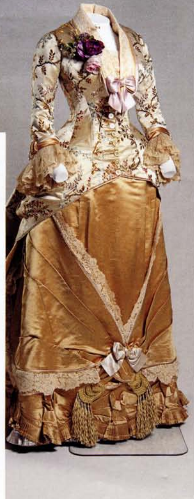
THE CENTURY CLUB Clockwise from top left: Paul Poirer's Sorbet dress, 1913, worn to a debut ball at Gladys Hall. Emile Pingat dress, 1878, cream silk brocade, lace, gold and yellow satin. The sleeves of the Pingat. Bottom: Charles James' Butterfly dress, 1954, made with peau de soie and nylon netting.